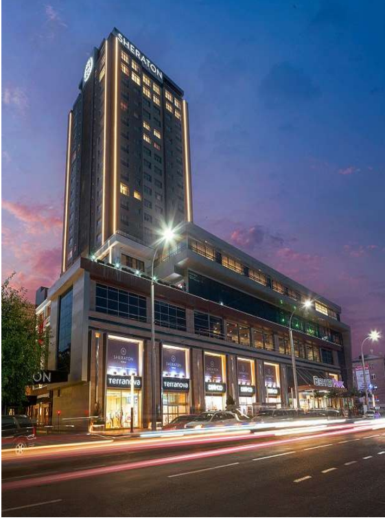
Bishkek Park Complex