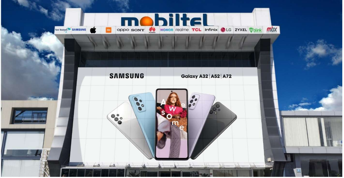
Mobitel Building – Çobançeşme E5 Highway / Istanbul

Until 2019, the subsidiary Mobil Turizm Yatırım A.Ş. operated retail stores in Istanbul to retail and wholesale mobile phones, phone accessories and operator products, and recently focused on real estate investments and projects. Mobil Turizm Yatırım A.Ş. has an office building of 2.410 m2 at No:16/A Yenibosna-Bahçelievler-Istanbul and rents this building to companies.