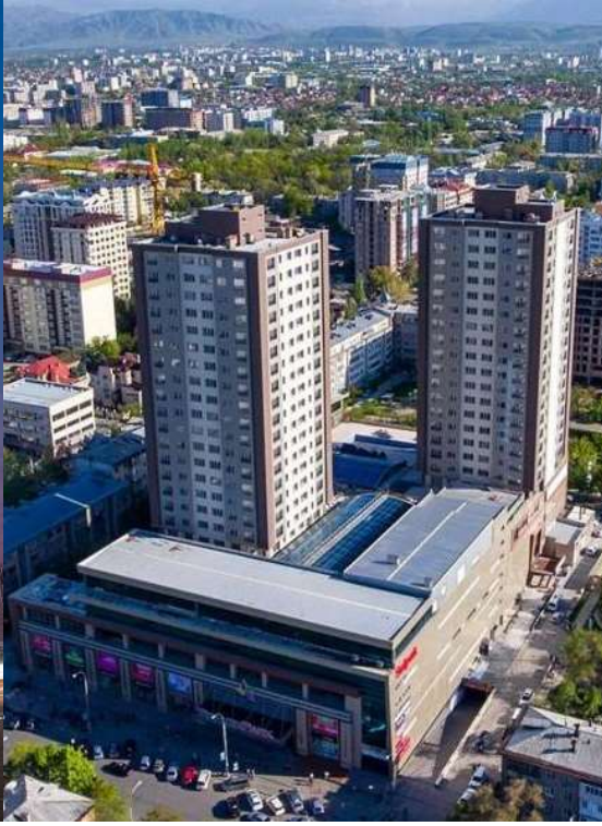
Bishkek Park Complex