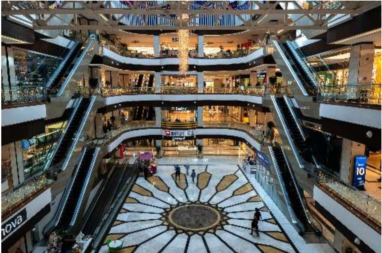
Bishkek Park Shopping Mall

Bishkek Park Shopping Mall, the first and largest shopping center of Kyrgyzstan, operates with a closed area of 48,000 m 2 with 5 floors and a large indoor parking area with a capacity of 550 vehicles on 2 floors. Bishkek Park Shopping Mall is a living complex with nearly 120 stores with leading brands in the world of fashion, supermarket and technology, more than 20 cafes and restaurants, and a large indoor parking lot. Bringing a new atmosphere to the shopping and social life in Bishkek, Bishkek Park Shopping Mall is visited by an average of 20,000 people a day.