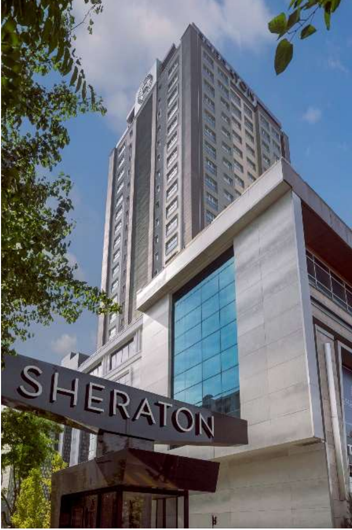
Sheraton Hotel Bishkek

Sheraton Bishkek Hotel, which started its operations in September 2019, provides service with a total area of 25.000 m2 on 24 floors, rooms with a total of 400 beds, king, suite and standard, meeting, congress and ballrooms for 1,000 people, pool, fitness, spa, patisserie and 4 different world restaurants.