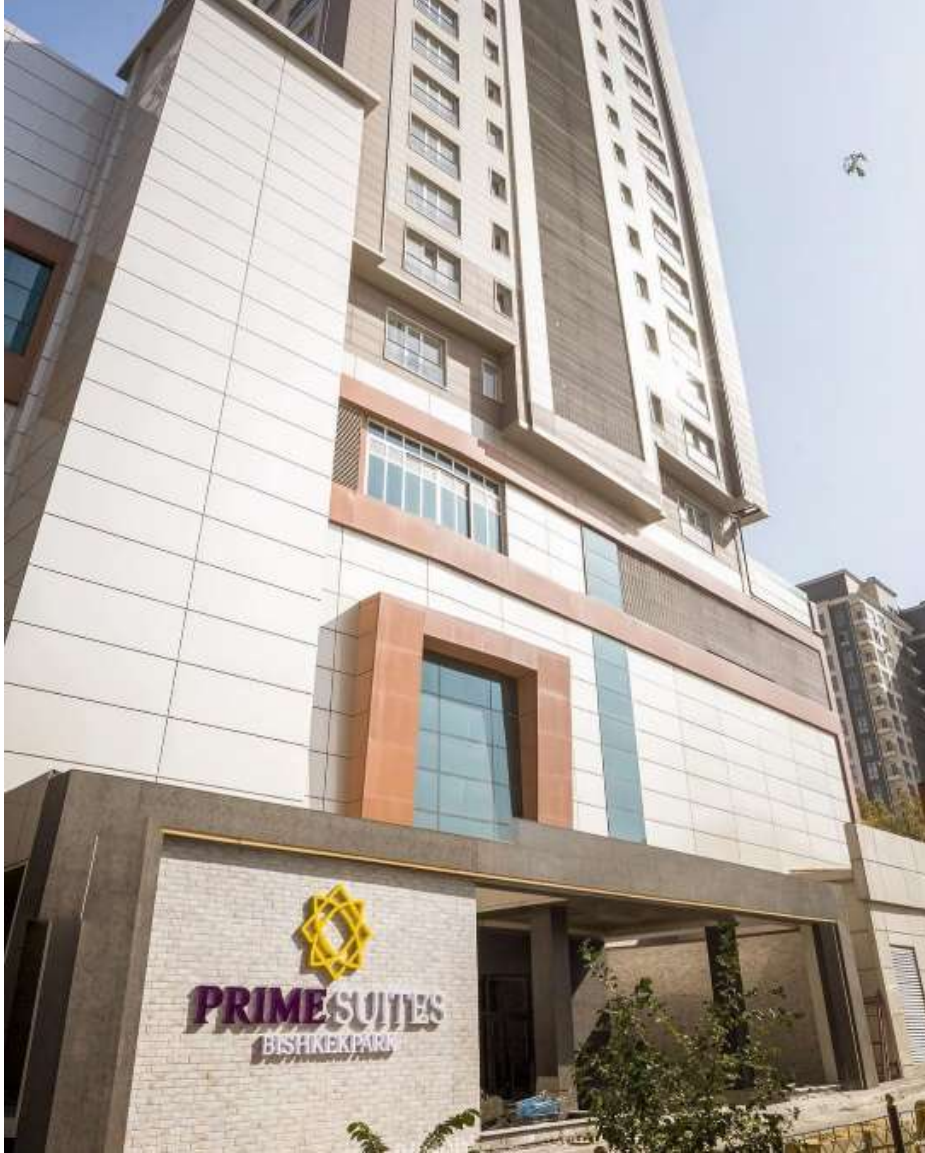
Prime Suites Residence

Prime Suites Residence is one of the tallest buildings in Kyrgyzstan with 24 floors and a total closed area of 12,500 m 2 , rising side by side to the Sheraton Bishkek Hotel on Bishkek Park Shopping Mall. The building, which has a total of 92 residences, has 7 different apartment types with housing options from 1 + 1 to 3 + 1. Prime Suites Residence provides rental services with 44 of these residences. Bishkek's first